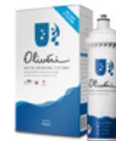
FS5010 Inline filtration system