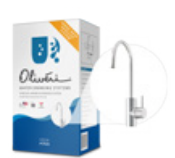
FS7025 Satellite filtration system